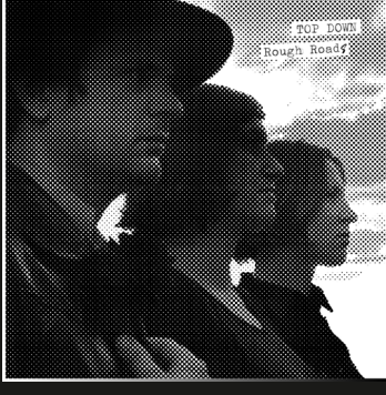
LP ROUGH ROADS